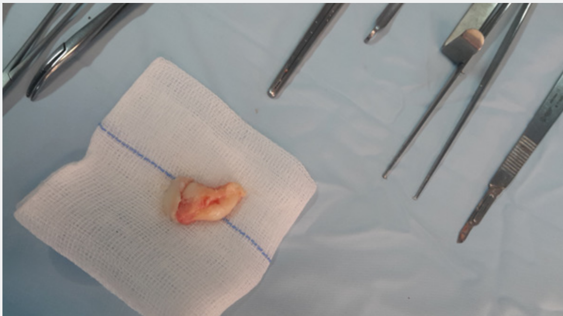
Figure 2: The whole scaphoid has been excised as one piece. Piecemeal excision can be done if excision as a single piece is technically difficult.