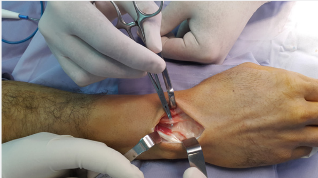
Figure 1: The PIN is identified at the floor of 4th extensor compartment. At least 2 cm of the nerve should be excised to achieve proper PIN neurectomy.

was released and transposed. The fourth compartment opened, and its tendons were retracted to the ulnar side, in addition to posterior interosseus nerve neurectomy. The capsule was opened with a radially based flap. Next, the whole scaphoid was excised, and a high-quality cancellous bone graft was harvested from distal radius and scaphoid bone (Figures 2 & 3).