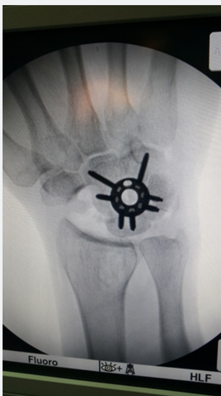
Figure 3B: Intraoperative x-ray is used to confirm carpal bones alignment, circular plate position and screws length.