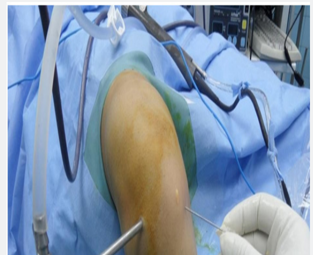
Figure 2: Accessory AM portal.