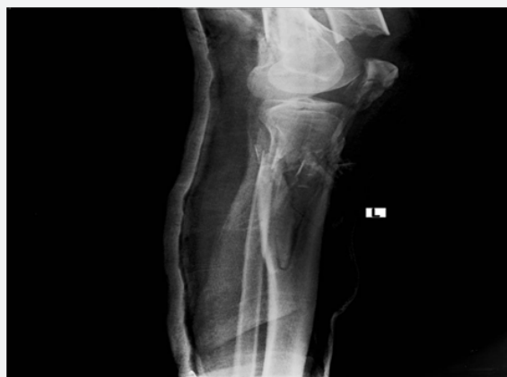
Figure 3: A worst type of the fracture floating knee with more compound fracture of the tibia.