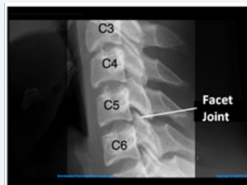
Figure 2: Showing Facet Joint.

These facts are clinically significant. The cervical capsular ligament is the smallest, thinnest, most injured ligament in a spinal trauma. It is also the least assessed ligament in a spinal trauma. This seems to make no sense, but the fact is, none of the standard imaging views of any standard protocol, assess this ligament properly. Special views are needed. That will be the focus of this survey, as most clinicians from multi-disciplinary health fields agree that these are serious injuries, and yet are commonly miss-diagnosed or not diagnosed at all. In preparation of this article multiple peer-reviewed published research articles were reviewed, all agreeing that chronic pain from spinal joint instability is a very significant clinical problem, causing significant clinical symptoms of chronic pain indefinitely, and may be the number one cause of chronic pain on the globe; yet few if any of those same published articles were in agreement as to a standard, objective diagnostic work-up, and/or treatment of the problem itself.