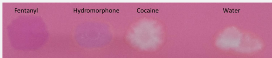
Figure 3: Eosin Y printed on paper with a commercial desktop printer. Fentanyl changes the paper to a darker pink and hydromorphone changes the color to a violet. Cocaine and water washed the sensor away.

Figure 3 shows eosin Y printed on paper with a desktop printer. Eosin Y is printed in a dark pink color. In comparison to the control (water), the addition of fentanyl and hydromorphone led to distinct color changes while cocaine did not. The water must be solubilizing eosin Y on paper and wash the sensor off the paper. In the presence of cocaine, this washing effect persists. However, hydromorphone and fentanyl do not exhibit this behavior, thus keeping the sensor deposited on the paper leading to a color change. This is advantageous for testing because analytes that are dissolved in water should not interact with the sensor and wash it off. Thus, while this paper based assay shows that cocaine is not a suitable analyte due to the washing effect, it does work well with fentanyl and hydrocodone.