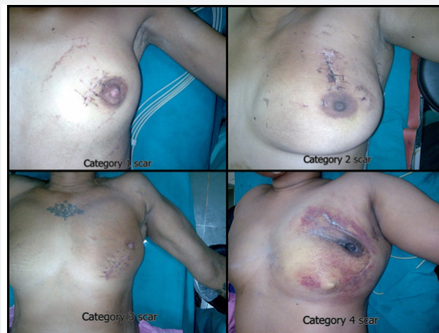
Figure 1: Few of the wrongly placed lumpectomy scars.