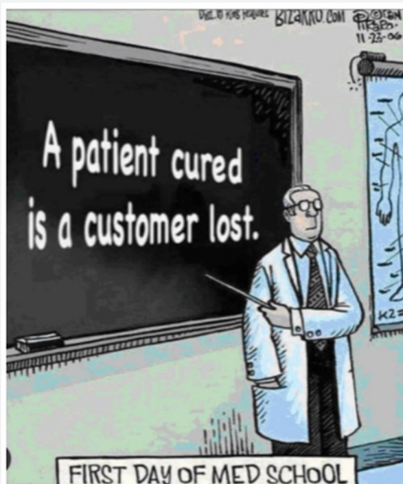
Figure 2: That the medical establishment seems unaware of the electrical properties of our bodies is very strange.

That the Medical Establishment Seems Unaware of the Electrical Properties of Our Bodies is very Strange