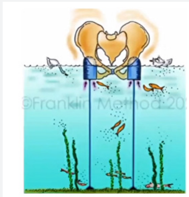
Figure 2: Metaphorical Imagery.

Alysen Starko-Bowes Franklin Method Equestrian Founder demonstrates tapping of the body using Franklin balls. Tapping is used for proprioception to stimulate the sensory nerves.