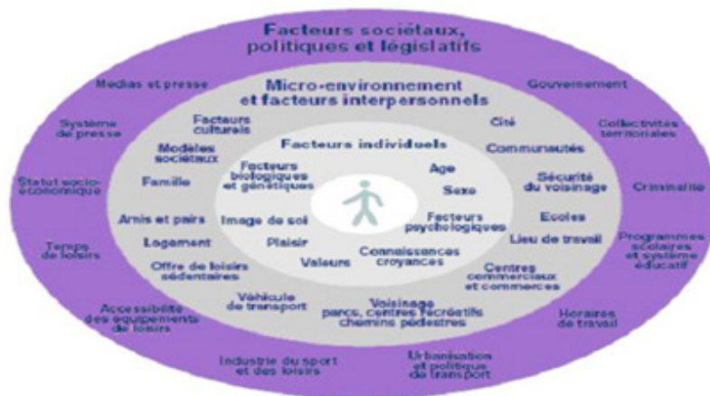
Figure 2: Socio-ecological model of health promotion

objective of our comparative case study is to find convergences between the different sport-health devices that emerged in three regions of France. Our work refers to the sociological theories of action logic Crozier and Friedberg [5] and mobilizes the ecological model of health Booth [1] but focuses on intermediate dimensions and on societal variables and individual factors (Figure 2). Indeed, the proliferation of health-oriented physical activity programs is developing in France and this action of health promotion at the national level involves exploring individual and collaborative parameters. The use of the ecological concept makes it possible to involve all the physical activity for health agents intervening at the heart of the device surrounding the user. Our problem is to identify, within the three territories, the invariants that stabilize the intermediate level (micro-environment & interpersonal factors).