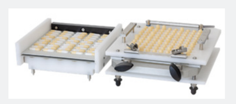
Figure 1: Manual Encapsulator.

reported difficulty in obtaining products compliant to quality standards. National Institutions and the Regional Governments provided a greater perceived support. More than about 50% of participants felt that their role did not change if compared to other healthcare professionals.