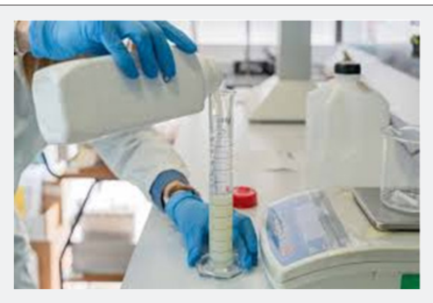
Figure 2: Galenic Laboratory.

Despite some limitations related to their clinical activity, pharmacists played a relevant l role in supplying personal protective equipment, medical devices MD and medications to improve health outcomes during this emergency. The results may guide pharmacists in future actions to improve the management of the pandemic [6]. Aid Progress Pharmacist Agreement Project: aims in developing countries Aid Progress Pharmacist Agreement (A.P.P.A.®) is a non-profit NP association based on a voluntary work and its main activity is the A.P.P.A.® Project. The Project started in the 2005 as a result of the cooperation between the Pharmacy Faculty of Turin (TO) and Italian community pharmacists. Its main task is the establishment of galenic laboratories (GLs) in hospitals