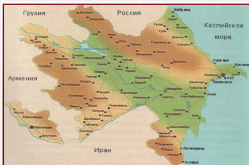
Figure 1: Map of Azerbaijan.