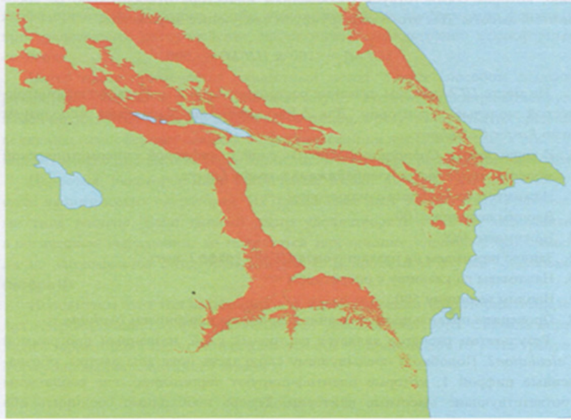
Figure 4: Result of the spatial analysis to define the territory of Azerbaijan, the relevant requirements of the investor.

investment plot at a distance of not less than 500m from the nearest coastline and 1000m from the urban areas. The possibilities are endless and depend solely on the needs of the user of GIS and spatial information availability.