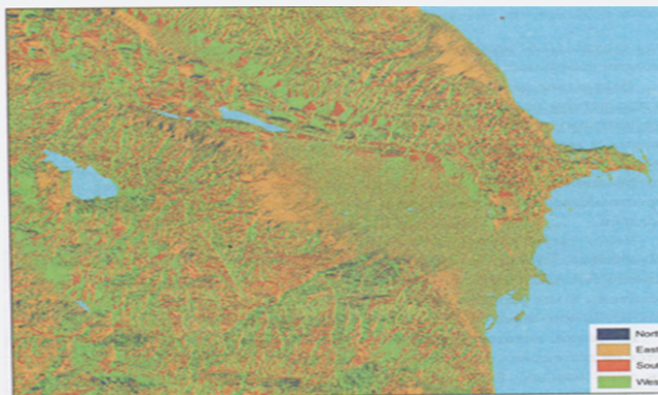
Figure 3: Map of exposures of the slopes, developed based on digital hypso-metric put Azerbaijan.