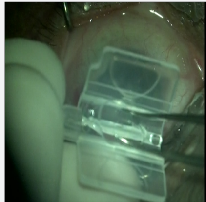
Figure 3: Foldable anterior chamber IOL in place.

(3) shows foldable anterior chamber IOL in place. Student's paired t-test was carried out to compare post-operative and pre-operative visual acuity (VA) and intraocular pressure (IOP). The analysis was performed using statistical software Epi-Info 7 and IBM SPSS 19. P-values less than 0.05 were considered statistically significant.