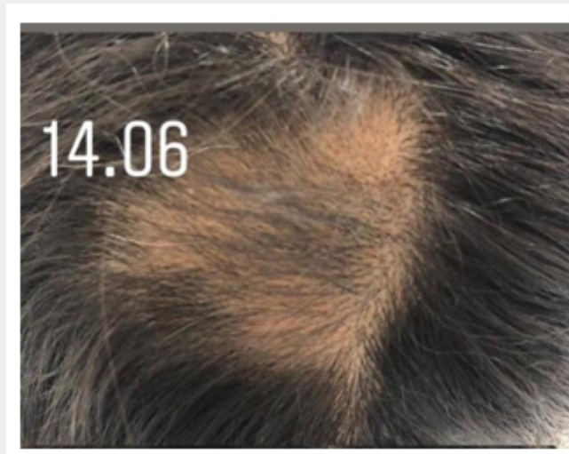
Figure 2: Photo documentation of patient 23 days after beginning treat corresponding to 7 a session.

of a conductive plasma jet which corresponds to 7 sessions, something around \frac{1}{3} of all treatment. At that stage it is possible to realize growth of new hair strands in the area suffering from alopecia areata . Figure 3 presents a significant strand growth in the coronal region. That photo was taken 60 days after beginning therapy, precisely in the 12 a session regarding \frac{2}{3} of the treatment. Observing that picture is almost impossible to notice the area priorly disturbed by the expressive hair loss. Figure 4 proves the efficacy of these treatments applied to the patient suffering from alopecia areata . That record was done in the 14 th regards to the last day of the therapy. After finishing the assessment of the treated area, it was demonstrated that it was unnecessary to keep with the sessions since the patient has already shown her scalp region recovered by new strand hair.