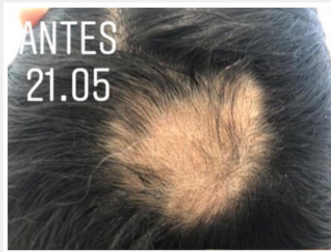
Figure 1: Photo documentation of patient at the first day before starting treatment.