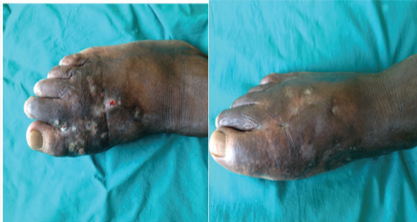
Figure 1: Comparative iconography of the dorsal aspect of the foot showing the mycetoma before (polyfistulized) and after 6 months (cicatrizated of fistulas and tumor) consumption of M. Oleifera .

noted only a moderate increase in sedimentation rate to 36mm at the first hour. The hemogram, liver function, renal function, muscle enzymes were normal. Histology compatible with mycetomanoted a polymorphic granulomatous infiltrate (histiocytes, polynuclear neutrophils and lymphocytes) with suppuration foci circumscribing small-sized pigmented grains with irregular contours.