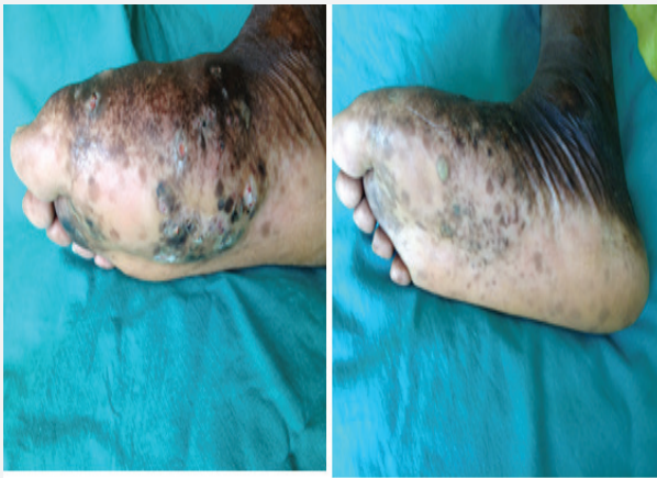
Figure 4: Comparative Iconography of the front foot (polyfistulization) and after 6 months of consumption of M. Oleifera (partial healing).

A mycological control (realized for free) of tumefaction was negative as well as the aspergillary serology (realized for free) performed (Ac antiA fumigatus EIA bio rad=0 AU/ml, and Ac anti A fumigates HAI <80).