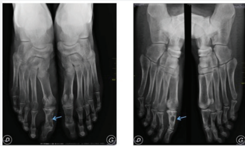
Figure 2: Radiography of the frontal and posterior feet: Bone luminosity with sharp, regular and opaque contours in the first phalanx of the first ray of the right foot. Thickening of the cortical bone of the 1 st phalanx and the head of the right 1 st margin.

The mycological study concluded a fungal mycetoma by highlighting Aspergillus fumigatus in the tumor collection. The X-ray of the right foot performed in frontal incidence and 3/4 revealed bone luminosity with sharp, regular and opaque contours in the first phalanx of the first radius of the right foot. A thickening of the cortical bone of the 1 st phalanx and the head of the right 1 st margin was noted. There were no other abnormalities in the bones (Figure 2). CT scan of the feet without and with injection of contrast agent with reconstruction in soft parts and in bone window revealed bone deficits hypodense of cortico-medullary seat, interesting the diaphyso-epiphyseal regions of the first phalange of the right foot and the head of the 1 st metatarsal. Their contours were sharp, regular and dense. The sesamoids were dense and atrophic. There was hypertrophy of the soft parts of the forefoot, enhanced after injection of contrast medium (Figure 3). No subcutaneous fluid collection was detected. These imaging aspects led to the conclusion that