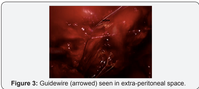
Figure 3: Guidewire (arrowed) seen in extra-peritoneal space.

At surgery, the right rectus sheath was entered just to the right and inferior to the umbilicus. The dissection balloon was not used for fear of dislodging the hookwire. Blunt finger dissection for about 3cm, was done initially and the first 12mm port was inserted. Gas insufflation to 12mmHg was commenced once the laparoscope was inserted and we verified that we were in the right plane. Further blunt dissection with the tip of the scope was done towards the midline and a 5mm port was placed midway between the umbilicus and the superior pubic ramus.