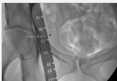
Figure 1: Intra-operative X-ray showing needle in right groin area.

The patient was a 50 year old intravenous drug user who was in the habit of injecting amphetamines and had a known history of Hepatitis C infection. One month prior to presentation,