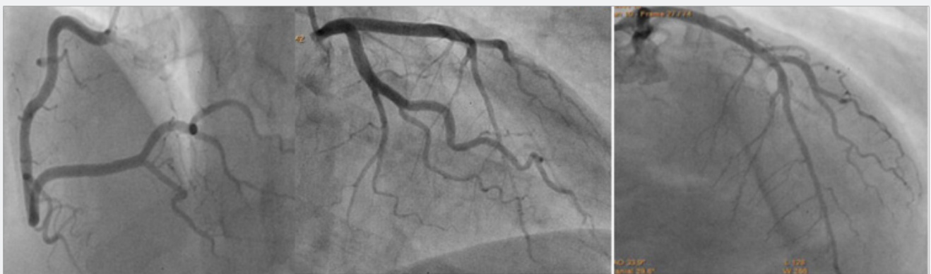
Figure 1: Right and left selective coronary angiograms showing right dominance and absence of any significant obstructive stenosis.