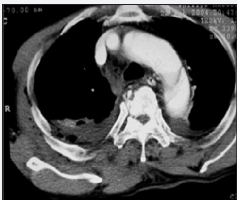
Figure 2: CT of the thorax evidencing filling failure in the posterior portion of the aortic arch and beginning of the descending. Bilateral hemothorax.

from 93% to 100% and specificity of 87% to 100% [3,15,16] (Figure 2).