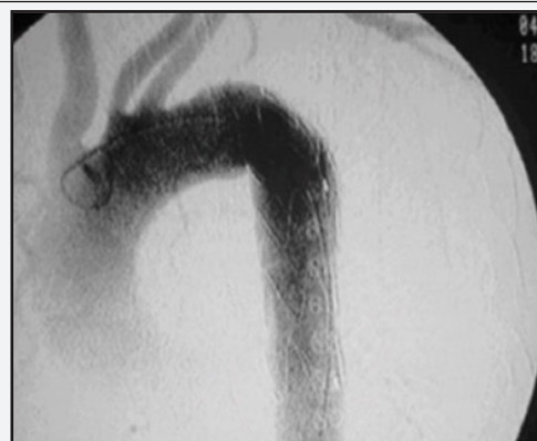
Figure 5: Aortography - After endoprosthesis implantation.

In the case of femoral arteries, after dissection of the right femoral puncture of femoral artery left there for the introduction of catheter, where there is the diameter of the aorta and if intralaminar defects are excluded, when inserted into the stent. Is recommended in victims with favorable anatomy, and has a more comfortable postoperative period and brief [7].