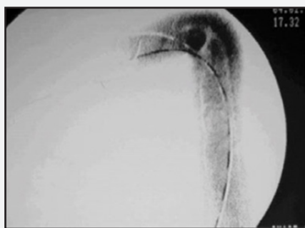
Figure 4: Aortography - Before endoprosthesis implantation. Note the graduated catheter and filling faults in the lumina of the aorta.

Endovascular thoracic aortic repair (TEVAR) refers to the minimally invasive approach, which involves placing a stent graft in thoracic aorta or ring, possessing ample indications. The technique involves inserting modular grafts through the dissection of iliac or femoral arteries to thoracic aorta excluding vessel damage [7] (Figure 4 & 5).