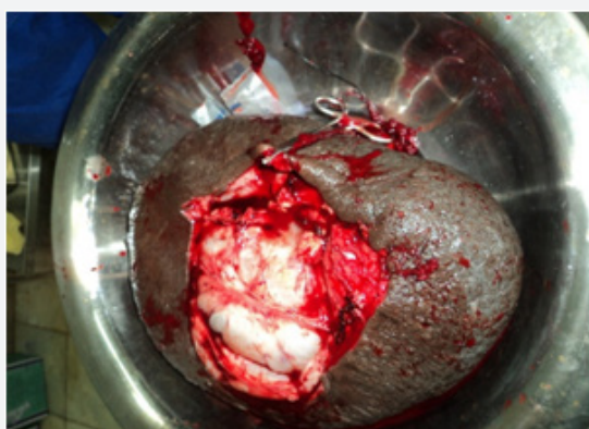
Figure 5: The whole mass excised weighing 6.5 kilograms from the left labia majora