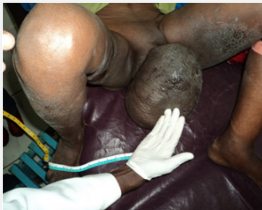
Figure 4: The skin over the left inner thigh is thickened with scaling due to chronic irritation by the mass

evidences of active tuberculosis was detected on examination of the other body systems. Chest x-ray, pelvic & abdominal ultrasound examination, complete blood count and skin snip for onchocerciasis are all negative. FNAC of the mass showed; evidence of chronic inflammation only. Filarial antigen test was not performed (not available in our set-up).