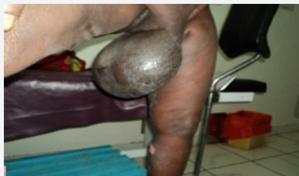
Figure 1: Unusually wide gait resulting from huge vulvar mass

2). The mass is pendulous and hanging down and obstructing the vulvar cleft and measures 45cm in length and 25cm wide. On standing position, the mass was hanging up to lower 1/3 rd of her thigh and with the overlying skin being hard, thickened and appearing to have extensive rugosities and hyper pigmentation. Up on palpation the mass was firm, irregular and none pitting and had no tenderness.