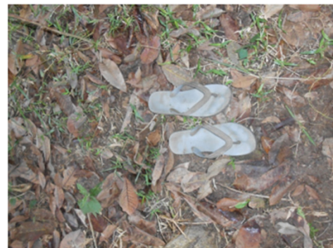
Figure 5: A pair of slippers near the spot suspected to be abandoned by the suspect.