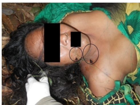
Figure 3: Victim with congested face, salivation from the right corner of the mouth (a) and bruises around the neck (b).