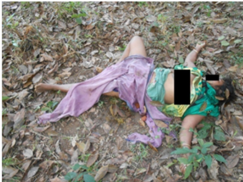
Figure 2: The half-naked victim girl with tilted face lying dead on the floor of a bushy area.