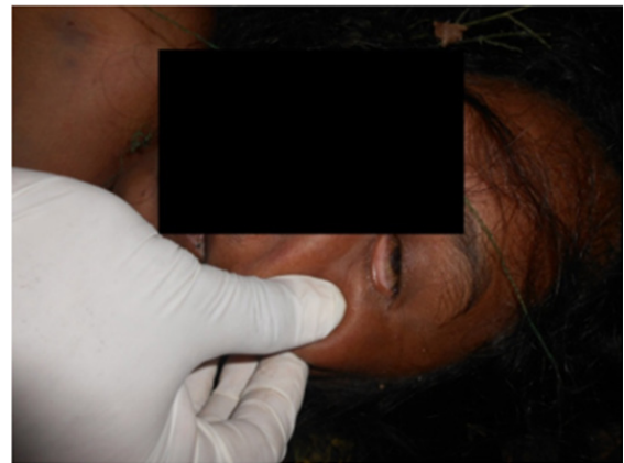
Figure 4: Victim having sub-conjunctival hemorrhage.