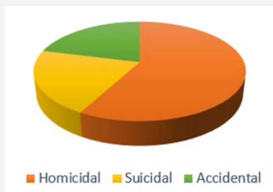
Figure 3: Type of Injury.

The data were analysed by descriptive statistical methods. Out of 19 cases, majority of the patients were male 14 (73.68%) compared to females 5(26.32%). Penetrating neck trauma were common in zone II, in which the injuries above the thyroid cartilage were 8(42.1%) & between thyroid and cricoid cartilage were 7(36.84%) and zone I had 4 patients (21.05%) (Table 1).