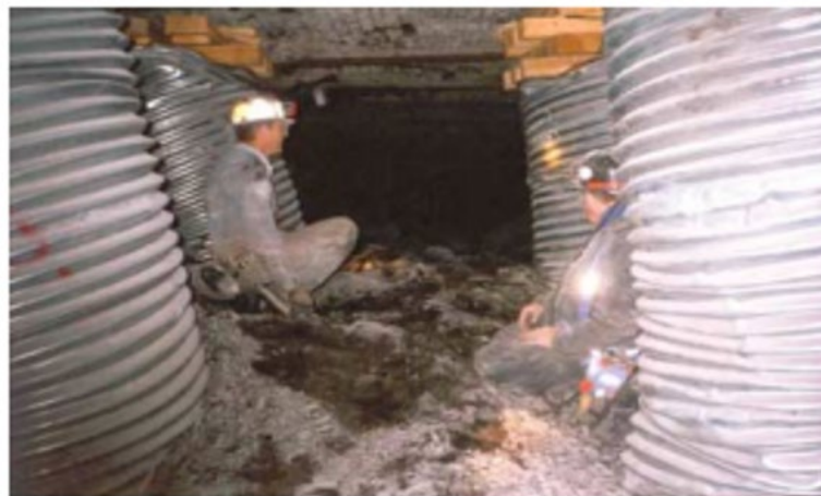
Figure2: Large Amount of Floor Heaver shown out by the Longwall Face caused Compression of the Support which Allowed it to Develop Sufficient Load Carrying Capacity for Roof Support in this Installation.