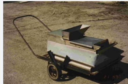
Figure 3: Laboratory shock-acoustic installation.

All connections are restored. In the space between the particles in the case of broken bonds, free water must be introduced. Only in this case the connections of the particles will be closed at a new free level. Only acoustic processing is not enough. The delivery of water to the clay particles in aggregates can be carried out by vibration or mixing. The researches processing of a clay material in a way of acoustic influence in laboratory installation is shown a basic opportunity of application of such method in scales accepted to use in industrial conditions (Figure 3).