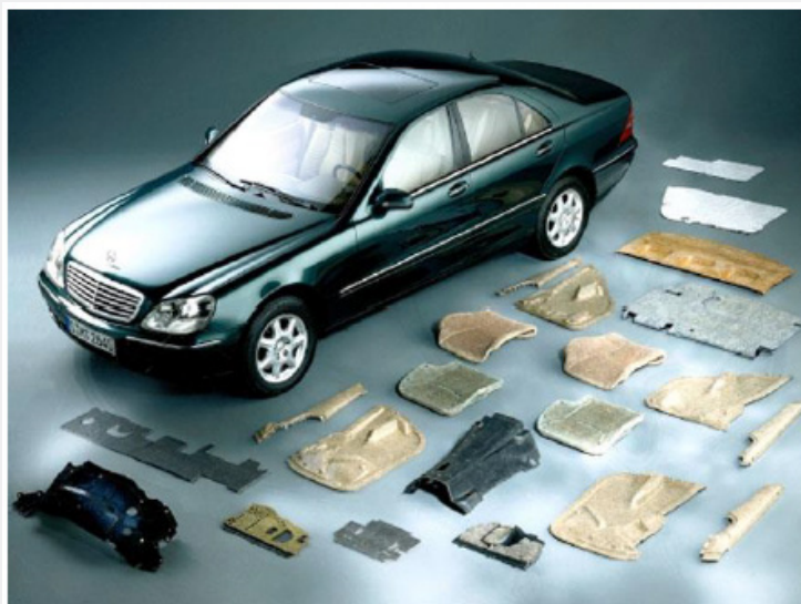
Figure 3: Biocomposites used in an automobile [21].

Mechanical properties of bio-composites are lower compared to polymer fiber composites. Surface treatments given to natural fibers will increase the mechanical properties since the interfacial bonding with the matrix material will increase. Many biodegradable polymer materials are developed through research and they replace synthetic resins. These polymers are suitable for use as adhesives, carpet backing and recyclable products. Flax and hemp bio-fibers are used for making products for automobiles, papers, packaging, furniture and building materials. Door panels, dashboards, trays, seat back linings are made of bio-fibers mixed with bio-degradable fibers. Jute based composites are used by Mercedes for E-class door panels, banana fiber composites for A-class and bio-composites for S-Class as shown in Figure 3. Japan produced a fully electric vehicle, "Grass hopper" which is produced using kenaf for the body [1,21,22].