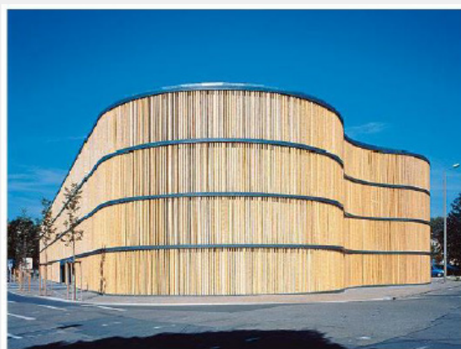
Figure 4: Parking Garage, Leipzig zoo, Germany [17].

made of metal [2]. Toyota used kenaf to strengthen a door trim [3]. The mechanical performance of bio-epoxy/flax composites along with the environmental benefits make them suitable for automobile body chasis, crash elements and body panels [23]. The applications of bio-composites are shown in Table 1 [24]. Figure 4 shows the parking garage of Leipzig zoo in Germany built with bio-composite bamboo.