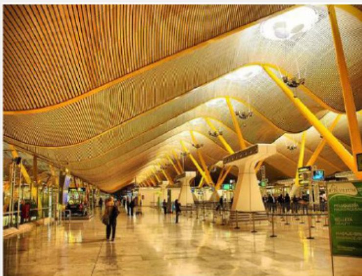
Figure 5: Madrid International Airport, Spain [17].