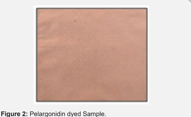
Figure 2: Pelargonidin dyed Sample.

Tables 1: The results of color fastness to washing sample is moderate to good.