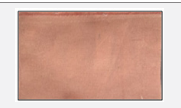
Figure 3: Aloe Vera finished sample.

a) Color Fastness to Wash: The Rating of color fastness to washing of the dyed sample was evaluated and presented in the below Table 5.