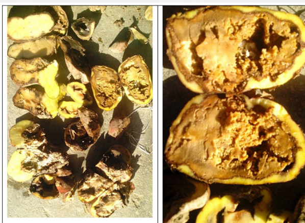
Figure 1: Potato tubers infected with late blight disease.