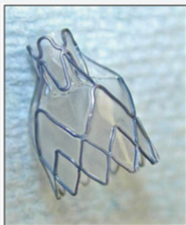
Figure 2: Endobronchial valve (zephyr) valve.