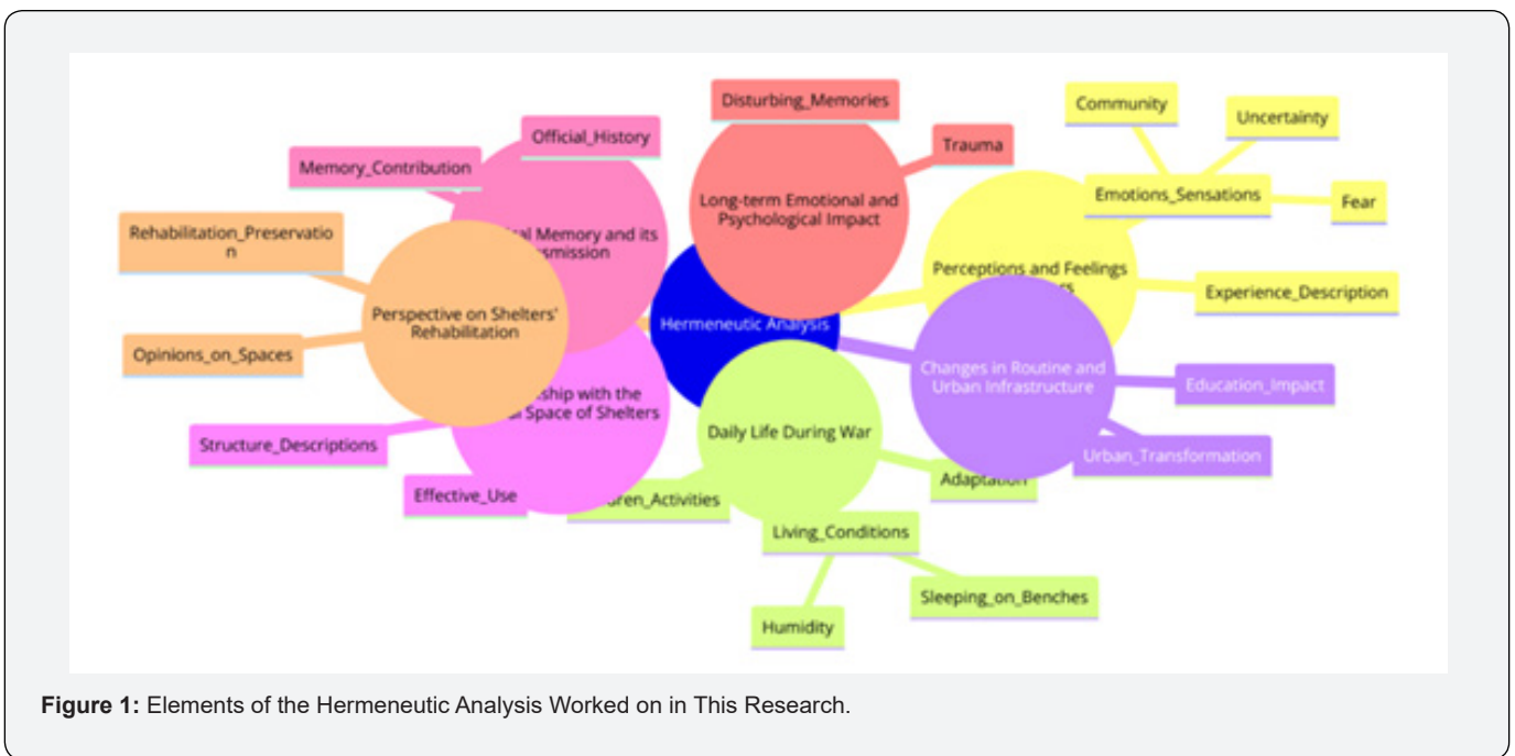
Figure 1: Elements of the Hermeneutic Analysis Worked on in This Research.

vi. Perspective on the Rehabilitation of the Shelters: Although the interviews do not directly address the rehabilitation of the shelters, we can interpret opinions and emotions towards these spaces and reflect on how their rehabilitation and preservation can serve to honor, remember, and educate about these experiences Figure 1.