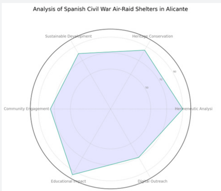
Figure 5: This visualization emphasizes key aspects such as heritage conservation, sustainable development, community engagement, educational impact, and digital outreach. It also underscores the role of these shelters in promoting historical memory and cultural identity, reflecting the study's conclusions on their significance for cultural, educational, and tourist development.

In conclusion, this hermeneutic study of the Spanish Civil War air-raid shelters in Alicante illustrates the potential of memory and historical heritage as resources for cultural, educational, and tourist development. The research highlights the importance of approaching heritage preservation not just as an act of conservation but as an opportunity to foster understanding, respect, and reflection on our collective history Figure 5.