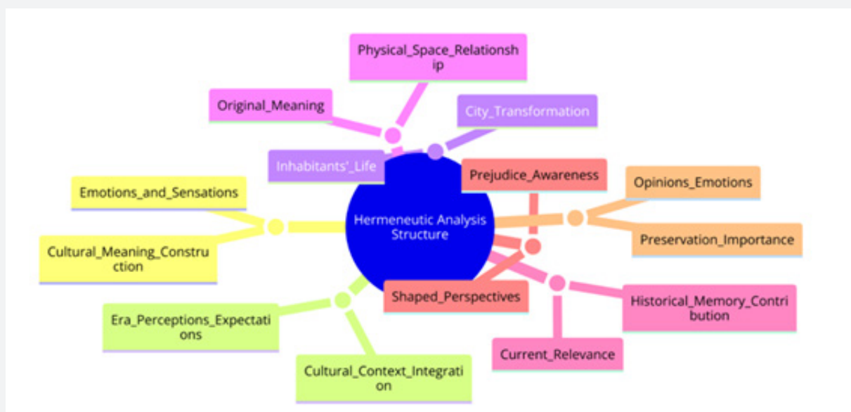
Figure 3: Combination of Approaches in Our Hermeneutic Analysis of the Interview on the Air-Raid Shelters of the Spanish Civil War.

vii. Perspective on the Rehabilitation of the Shelters and their Current Cultural Relevance: We will interpret opinions and emotions towards the shelters and their rehabilitation, considering how this relates to the current cultural and social context, and the importance of preserving these memory sites