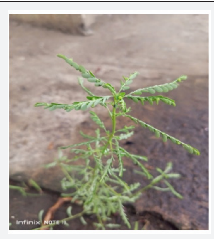
Figure 1: Phyllanthus amarus growing in Madonna University campus, Elele, Rivers State, Nigeria.