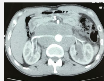
Figure 1: left lateral-vesical mass of retroperitoneal compatible with a malignant process on the ectopic testicle.

lymph adomectomyencom passing large vessels and A left uretero-hydronephrosis (Figure 2). Surgical exploration revealed a voluminous left lateral-vesical poly lobal testicular tumor. The anatomopathological examination concluded in a seminome on ectopic testicle with invasion of the epididymis and infiltration of the albuginea without lympho-vascular invasion. The patient received just after 3 BEP cures (bleomycin, etoposide, cisplatin). The thoraco-abdomino-pelvic CT scan and tumor control markers were not shown to have residual mass.