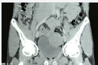
Figure 2: Retroperitoneal abdominal lymph adomectomyencom passing large vessels and A left uretero-hydro nephrosis.

after 3 BEP cures (bleomycin, etoposide, cisplatin). The thoraco-abdomino-pelvic CT scan and tumor control markers were not shown to have residual mass.