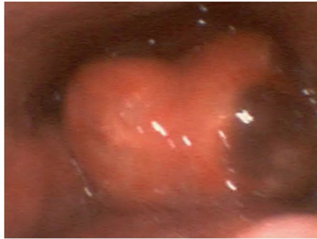
Figure 4: Flexible nasoendoscopy with an epiglottic abscess, “cherry red” epiglottitis and an area of necrosis on the left side of the epiglottis.

difficult airway trolley and a tracheostomy tray must be set up at the bedside. Paralytic agents of skeletal muscle should be avoided to prevent cessation of spontaneous ventilation and increased risk of a surgical airway. The trachea in children can usually be anesthetized with a deep inhalation agent. Although the time necessary for deep anaesthesia may be increased due to airway obstruction. Capnography monitoring of exhaled gas analysis is useful in determining the depth of anaesthesia (Figure 4).