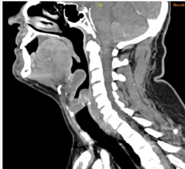
Figure 2: CT scan of the soft tissues of the neck demonstrating a rim enhancing collection within the epiglottis suggestive of an epiglottic abscess. There is also oedema of the supraglottic region.

blood and throat cultures can be obtained once the airway is secured. Usually, blood and throat cultures are negative and rarely change clinical management. Ultrasonography has been described as a method to evaluate patients by visualizing an “alphabet P sign” in longitudinal view through the thyrohyoid membrane [20]. Although a stable clinical condition is advised prior to instrumentation of the ultrasound probe alongside the neck in children with suspected epiglottitis.