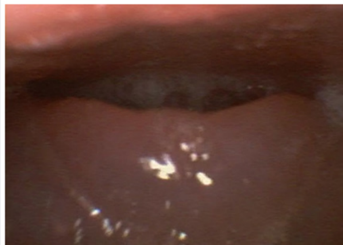
Figure 3: Flexible nasoendoscopy view of epiglottic oedema with the glottic inlet not visible.

Securing the airway is the most important management of an epiglottitis in both children and adults. This needs to be performed