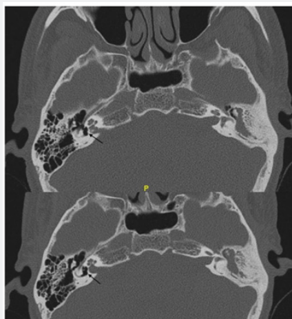
Figure 3: High Resolution Computed Tomography images of temporal bone (axial view). Black arrow indicates air bubble within the labyrinth.