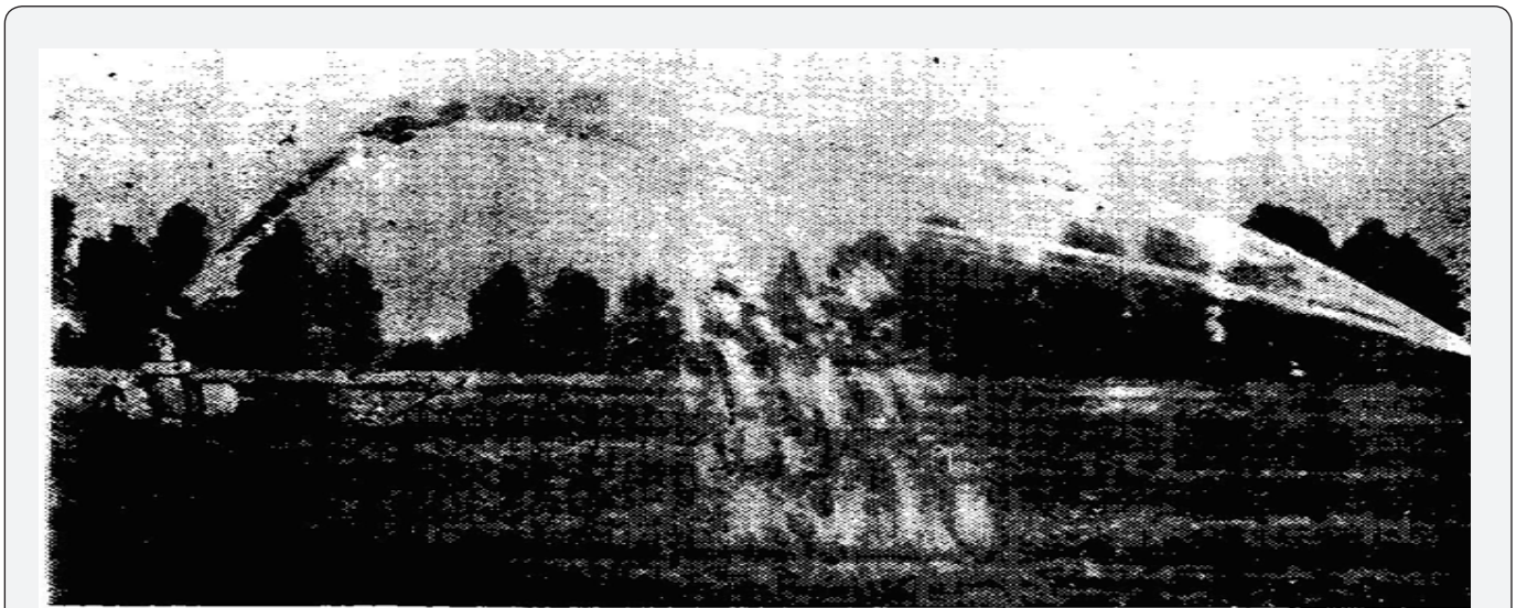
Figure 2: Demonstrations of the micro irrigation regime with the use of IDAH in conditions of irrigation of sugar beet, maize for power and soya in the Terter AIS of the Institute of "Agriculture".

The discharge was 20-30%, which led to uneven moistening. At the beginning of vegetation due to timely treatments, the surface discharge decreased (up to 8-10%). When the treatment of crops ceased, the discharge again reached 16-17%. Demonstrations of the micro irrigation regime with the use of IDAH in conditions of irrigation of sugar beet, maize for power and soya in the Terter AIS of the Institute of «Agriculture». Soaking of the soil during watering did not exceed 30-60 cm.