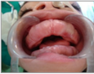
Figure 2 : Clinical intraoral view.