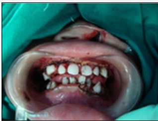
Figure 4 : Immediate post operative view.