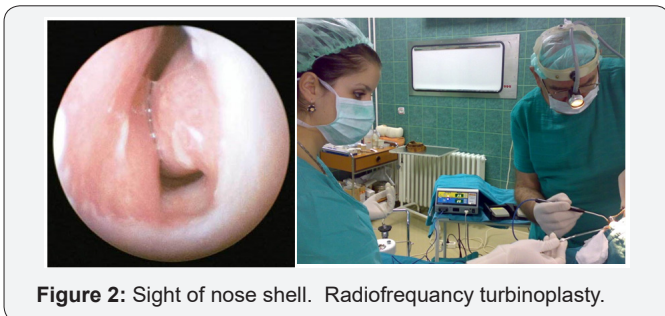
Figure 2: Sight of nose shell. Radiofrequency turbinoplasty.

Up to now, to eliminate obstruction factor irritated by hyperplasia of konhi mucosis, the way was to get through surgical intervention under total anesthesia followed by risk of bleeding and tent-wick wear in nose during several days. That refers predominant on conventional techniques as are partial or total resection of lower nasal shells. As by-effect, some particles appear to fall from nose for weeks. Consequences and complications after mentioned interventions can appear in shapes of increases and scars that lead to secondary occlusion of nasal channels and lately to atrophic rinitis as well. With contemporary rinosurgery technology at hand, above mentioned complications could be avoided. New methods in submucosis konhoplastics are the leaders of our times (Figure 2).