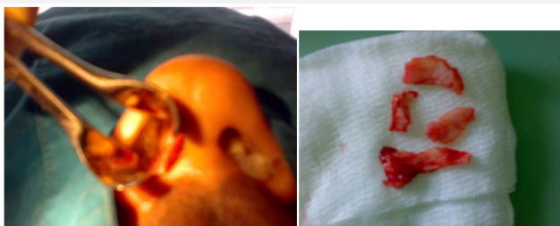
Figure 1: Eliminated bone part of nostril septum from patient with septum fracture. Alongside with restoration of normal nasal respiration, in some 20 per cent cases the snore is eliminated as well

Numerous competent and scientific papers see connection between chronic nasal obstruction and frequency of loud sleep and split during breath. Narrowness of airway, collapsibility and bigger resistance of air flow are cognizable factors contributing to that syndrome. Loudness during breath can correlate with percentage of nose plug. To every very loud sleeper detailed clinical review of nose is recommended. Approximately, more than 40 per cent of snore-sleepers complain on hardship during breath through nose. Lot of inventions, gadgets and products that have been used as external or internal dilators of nostrils, reduce snore with bigger or smaller efficiency. Prevention of nostril wings collapse with 3-M band diminishes residence of airflow and, consequently, noise during sleep [1-3].