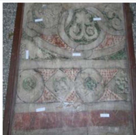
Figure 1: Detail of the painting with places of swabs.

next colonizers fungi and lichens [2]. The metabolism of these microorganisms secretes oxalic acid ( H_2C_2O_4 ) which can react with calcite CaCO_3 present in the paintings giving rise to calcium oxalate ( CaC_2O_4 ) [3]. The growth of biological agents such as fungi is identified as a determinant factor in the degradation of the murals can cause vital deterioration factors such as discoloration of the mural surfaces, detachment of the fragments and biofilms formation. on other hand the bacilli generate energy from the oxidation of reduced sulphur compounds producing sulphuric acid as the end product [3] (Figure 1).