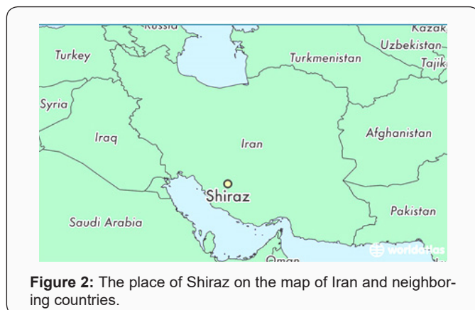
Figure 2: The place of Shiraz on the map of Iran and neighboring countries.

Shiraz is located in the southwest of Iran on a seasonal river called for "Roodkhaneye Khoshk. Figure 2 illustrates the place of Shiraz.