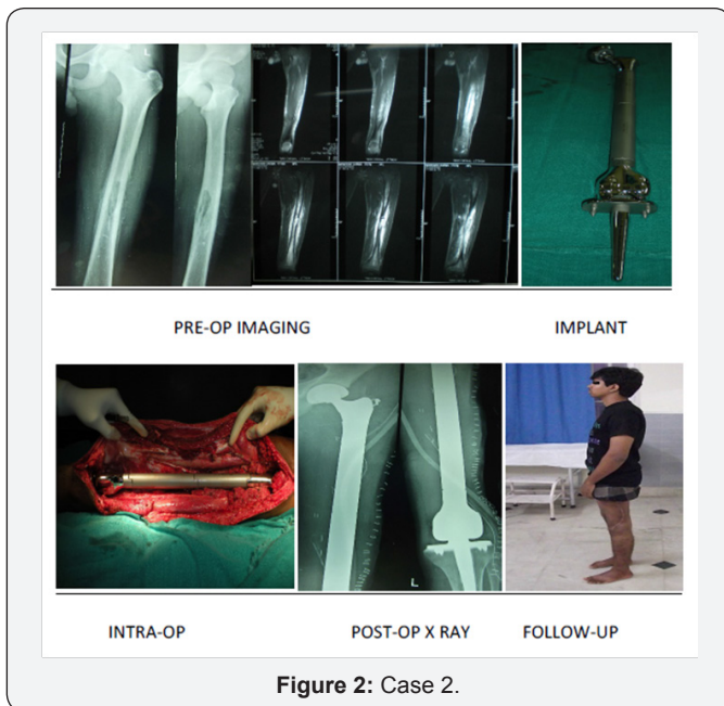
Figure 2: Case 2.