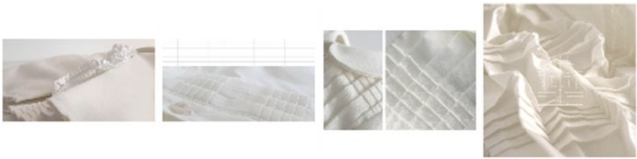
Figure 3: Enhancement of perceptive and sensorial qualities on textiles.

Such actions through the fabric thickening define a tridimensional structure of the surfaces. Such development of the textile row materials is a result of the Mafrat philosophy, very careful about their products quality. Their interpretation of innovation does not belong to the concept of a new product but rather to an enhancement of the emotional value coming from the multisensorial growth of the materials used (Figure 3).