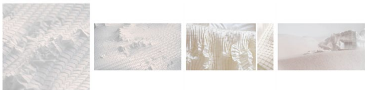
Figure 1: Emotional feel of soft surfaces.

The design of surfaces is, among the search themes of contemporary design, most interactive with researches on multisensoriality, new material design and innovative use of existing materials. The expressive and sensorial dimension of design in relation to materials should be intended as material experience representing the research forefront of the last decade [1].