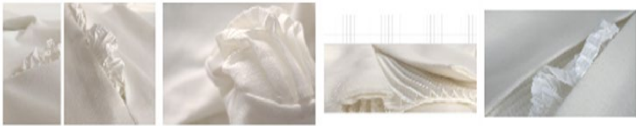
Figure 2: Combination and application of materials.

A material is innovative during its phase of elaboration (nanomaterials, nanocomposites, etc.) or, after its conception, along its phase of application. As such is innovative a technological transfer regards the use of material or technology where it has never been used before or combined with other materials in order to obtain composite or hybrid structures (Figure 2).