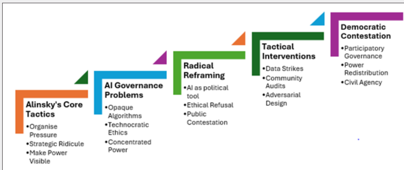
Figure 1: From Alinsky to Algorithm: A Tactical Map of Radical AI.

legal standards. From this perspective, AI is not just a governance issue but a political project that requires a political response.