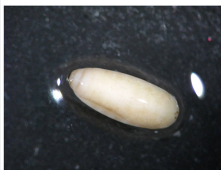
Picture 1: Pupal of Drosophila suzukii (Photograph by Yousef Naserzadeh, Moscow, Russia, and All-Russian Centre for Plant Quarantine, FGBU VNIICR).

Laboratory, Institute of agriculture. The rearing stock of the fruit flies was made up of four pairs of adults that originated from a laboratory belonging to the department of plant protection, PFUR in Russia (Picture 1). The dipteran colony as well as these experiments (described below) were maintained under laboratory conditions of 23 \pm 1 °C and 40 \pm 5 % relative humidity. All the tested fruit (described below) were collected in June 2021 in the Kashan province, which is a city in the northern part of Isfahan region, Iran ( 33^{\circ}58'59.09''\text{N} , 51^{\circ}26'11.18''\text{E} ). Fruit that was reddish in color were collected directly from the trees and were immediately brought to the installations previously mentioned.