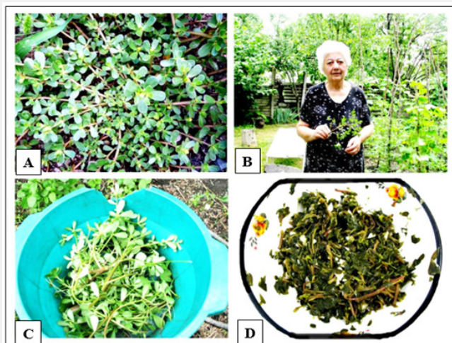
Figure 3: A: Medicinal plants are for Portulaca oleracea in the village Shilda in Kakheti, Georgia; B: Appearance is the place and where my mother Tsira Sidamon-Eristavi is apartment in Shilda; C: Medicinal plants are food will be hidden; D: The food is added to a lot of work as medicinal plants add it to the wine cellar with fresh garlic and salt.

those of resistant plants. Susceptible Portulaca oleracea had a significantly higher CO 2 assimilation rate at 30 °C, but was similar to that of resistant Portulaca oleracea at 40 C. The susceptible biotype had a significantly higher CO 2 assimilation rate. The chromosome number for genes are as Sporophytic 2n=54 and Gametophytic n=27 in Kakheti.