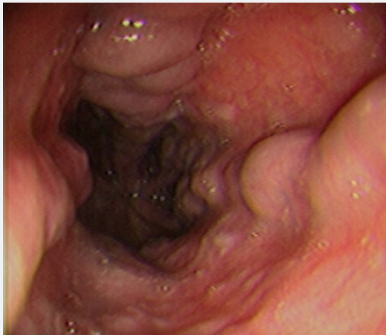
Figure 2: Ct abdomen showing acute pancreatitis with portal vein thrombosis and endoscopy of UGIT showing grade 1-2 esophageal varices.