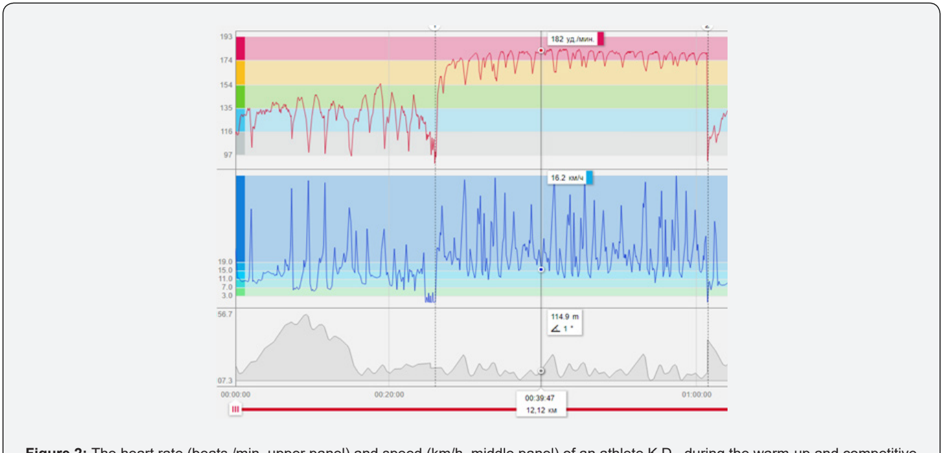
Figure 2: The heart rate (beats /min, upper panel) and speed (km/h, middle panel) of an athlete K.D., during the warm-up and competitive 15 km speed skating race at the "Continental Cup of Eastern Europe" in Syktyvkar, as well as the terrain of the ski slope (degrees, bottom panel) - according to the data of remote heart rate registration using the POLAR H10 chest sensor.

Indirectly, this means that the synthesis of non- neuronal Ach persists for a long time, even with a decrease in the volume and intensity of training loads. It is also obvious that in the process of training and competitive loads aimed at increasing endurance, the activity SD of the ANS increases, as can be seen from the data of the remote heart rate registration of the skier-racer K.D., conducted using the POLAR H10 chest sensor (Figure 2). It is the SD of ANS that is the mechanism that prevents the excessive influence of non-neuronal Ach on the heart, and thereby prevents the formation of "sinus node weakness" at rest. We assume that the decrease in pNN50%, which can occur in an elite skier at the end of his sports career, will probably serve as one of the indirect evidence for the presence of non-neuronal synthesis of Ach by cardiomyocytes.