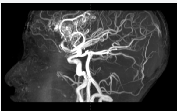
Figure 1: MRA.

8 year old Jehovah's Witness female with a history of ruptured frontal arteriovenous malformation s/p bi-frontal craniotomy for clip ligation and embolization in 2015, was in her usual state of health until she developed a severe frontal headache, emesis, and altered mental status. MR angiography revealed a new 3.3 x 4.3 x 3.0 cm intranidal aneurysm with an underlying intraparenchymal hematoma (Figure 1). The decision was made to perform an AVM resection [1-3].