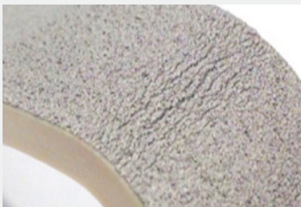
Figure 1: EN ISO 7438 bending tests of 6 plasma-spray-coated implant surfaces clearly show cracks in the coating layer. A further consequence may be delamination / abrasion. In-house research.