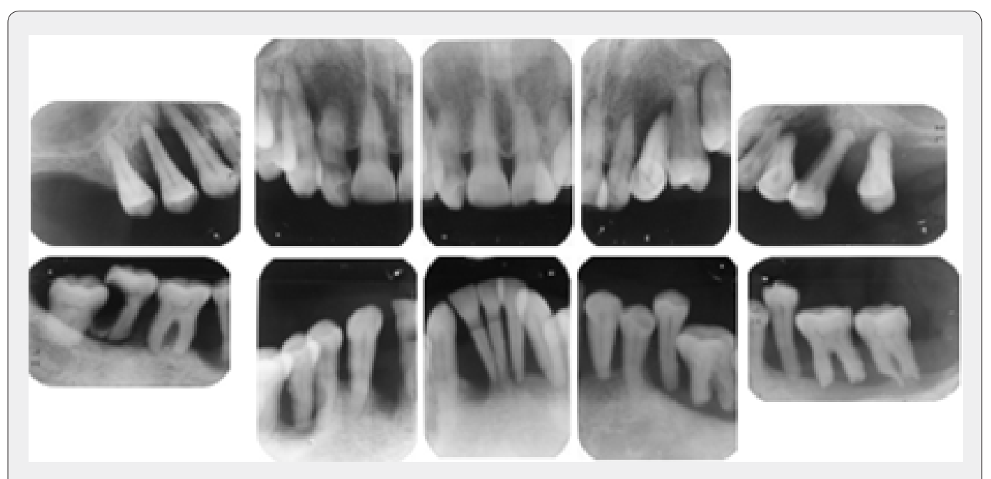
Figure 2: Periapical radiographs showed cases of affected moderate to severe alveolar bone loss and SOT around both maxillary and mandibular teeth at the baseline data February 20, 2013.