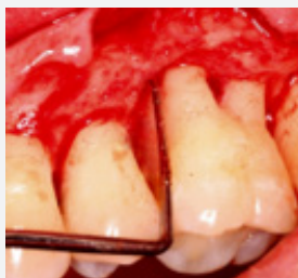
Figure 4: Reflected flap with a periodontal probe indicating a circumferential defect.

Full-thickness flaps were elevated, granulation tissue adherent to the bone was removed and the tooth surfaces were debrided thoroughly. After root conditioning with EDTA gel (Straumann PrefGel™, Straumann, Basel, Switzerland), the 3-wall bony defect on the mesial site of the first premolar (Figure 3) and the circumferential defect around the first molar (Figure 4) were gently filled