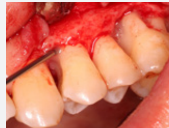
Figure 6: Placement of the enamel matrix derivative into the surgical sites.