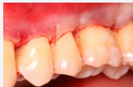
Figure 8: Using a coronally advanced flap technique, the flap was sutured into position (buccal view).