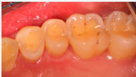
Figure 11: Palatal view, 12 months after surgery

Following the placement of the regenerative materials in the intra bony defects, the patient was reviewed at 1, 4 and 12 months. Excellent healing of the soft tissues was evident with no signs of inflammation observed (Figures 10 & 11) and probing depths did not exceed the accepted 3mm pocket depth for healthy gingiva.