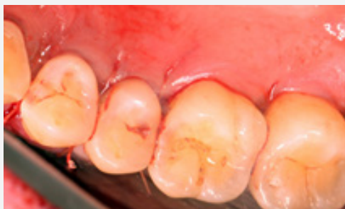
Figure 9: Using a coronally advanced flap technique, the flap was sutured into position (palatal view).