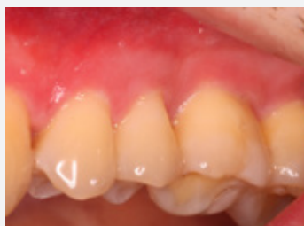
Figure 10: Buccal view, 12 months after surgery.