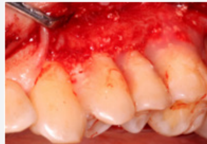
Figure 7: Application of the EMD and bone ceramic into the bone defects.