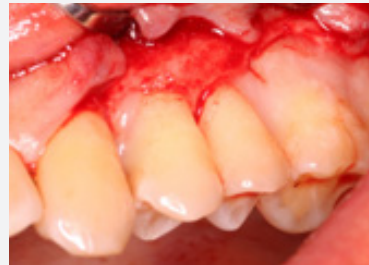
Figure 5: EDTA application following the preparation of the root surfaces.

with the mixed material (Figures 5-7). The flaps were coronally advanced and secured with simple interrupted sutures (4.0 glu-colide/lactide copolymer sutures {Polysorb™}) (Figures 8 & 9) and post-operative instructions were given to the patient (Patient was instructed to refrain from toothbrushing of the site for two weeks, to rinse with 0.12% chlorhexidine mouthwash {Corsodyl GSK®} three times daily and to have a soft diet, avoiding any brushing or eating in the region of the surgical site).