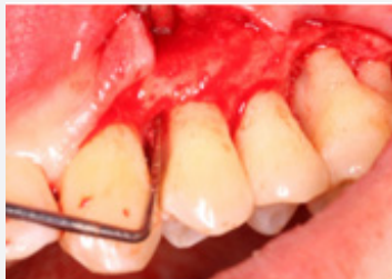
Figure 3: Reflected flap with a periodontal probe indicating a shallow 3-wall defect.