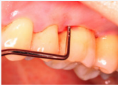
Figure 1: Periodontal probe measuring a pocket depth of up to 8mm.

er Class II involvement of all furcation and bleeding on probing. An angular bony defect was also noted mesially of the same tooth on a PA (Figures 1 & 2).