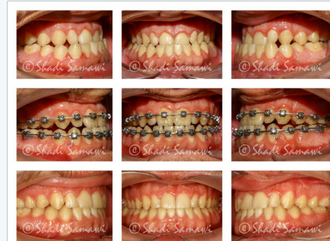
Figure 1: An example of an Adult Class III malocclusion with moderate skeletal severity, successfully-treated and camouflaged with a passive self-ligating system (Damon Q; Ormco), utilizing the techniques mentioned above.

Clinically, It seems there is a very reasonable clinical validity to such claims. The main noticeable issue faced at the aligning phase is the incomplete – or delayed – correction of rotations which is most probably due to the increased “play” between the small initial arch wires and the 0.022” slot of the Damon Q bracket, where full engagement against the slot base is non-existent due to the nature of the locking mechanism’s “passive” construction. Full rotational correction does not actually occur until later in treatment when –at least – an 0.016”×0.25” or 0.018”×0.25” rectangular arch wire is in place. This probably explains the findings of a study by Miles et al. [2] and others that have shown no measurable statistical difference in alignment speeds between self-ligating appliances in general and conventional appliance. In fact, some studies noted that alignment was actually faster with conventional appliances in many instances (Figure 1 & 2).