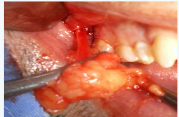
Figure 5: The fat pad pedicle under intense traction to be scised.