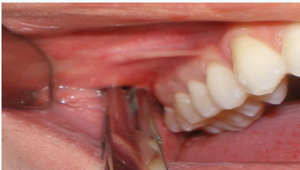
Figure 2A: Hemostat lightly opened inserted through the incision into left and right side.