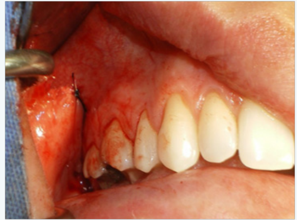
Figure 7: A single suture is normally enough to close the incision.