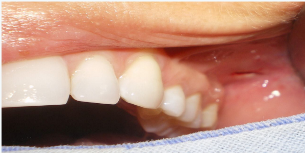
Figure 1: Small incision performed at the base of the zygomatic buttress.

local anesthesia to suture. There are no formal indications for sending the specimens for histo pathological examination unless any different aspect of the structure is macroscopically observed as far as color and/or caliber of blood vessels is concerned. Pain medication is regularly prescribed along with intense bilateral cryotherapy in the areas during 24 to 48 hours. Prophylactic antibiotic can be prescribed and a five to seven days antibiotic prescription is a good option when the fat pad is not removed in just one piece. Very rare problems or accidents during the surgical procedure can occur and are resumed as lesion to the Stensen's duct and its aperture and injury to the buccal branch of the Facial nerve resulting in Stensen's duct injuries, which are manifested with sialoceles or salivary fistulas [3], and temporary numbness of the long buccal nerve. The results can effectively be seen after four to six months when the soft tissue edema is definitely resorbed away (Figures 8A-8C, Figures 9A-9C).