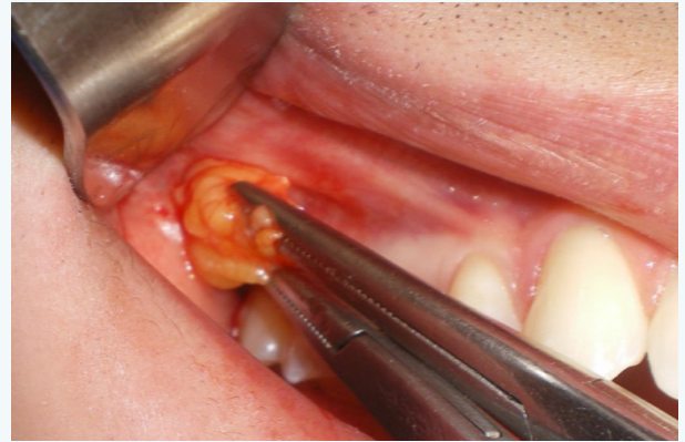
Figure 3: Small hemostats are intercalated during the fat pad traction.