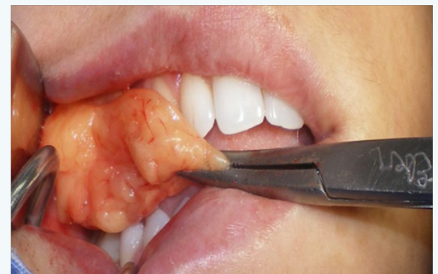
Figure 4: The whole fat pad is pulled out and exposed to the oral cavity.