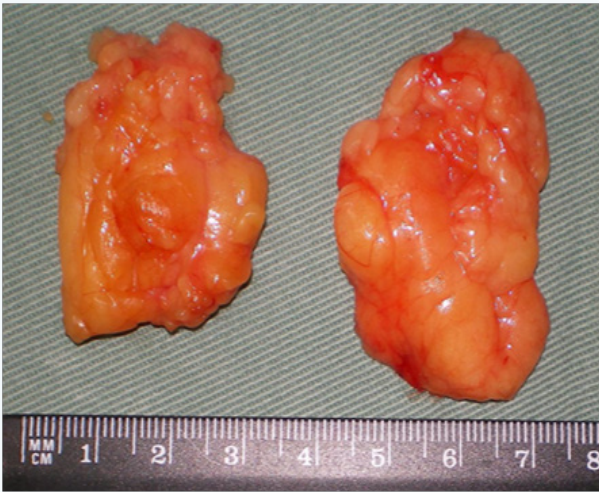
Figure 6: The right and left fat pads exposed after being entirely removed as one piece structure.