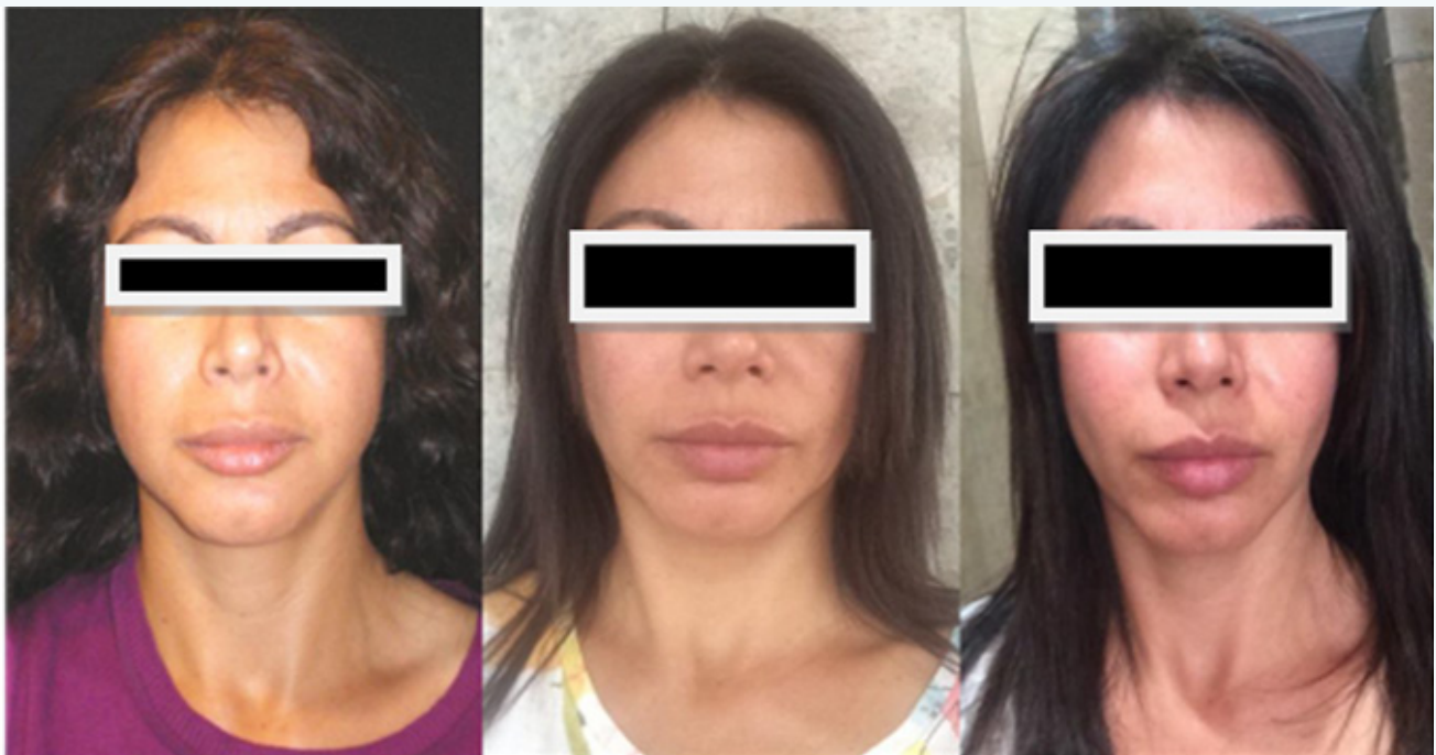
Figure 8A-8C: The first picture shows a female patient before Bichectomy. The second picture shows two months follow-up. The last picture is four months post-operatively.