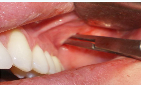
Figure 2B: Hemostat lightly opened inserted through the incision into left and right side.